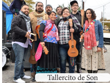
Tallercito de Son