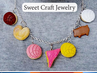
Sweet Craft Jewelry