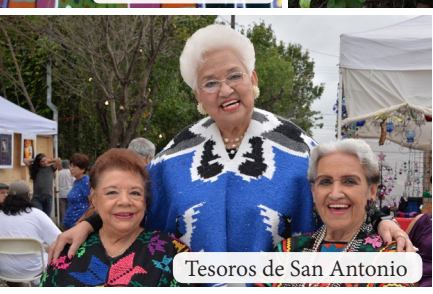
Tesoros de San Antonio

Non-Profit Org. U.S. Postage PAID Permit No. 332 San Antonio, TX